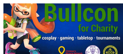
Bullcon Charity Tournament November 10th, 2019 $2500 Dollars Raised