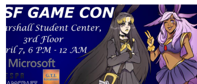
USF Game Con Spring April 7, 2018 250 Attendees