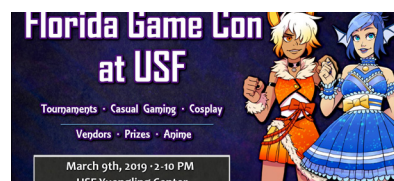
Florida Game Con March 9, 2019 1500 Attendees