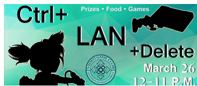
Ctrl + LAN + Delete March 26, 2016 210 Attendees