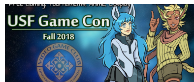
USF Game Con Fall November 10, 2018 260 Attendees