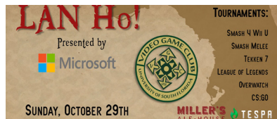
LAN Ho! October 29th, 2017 220 Attendees